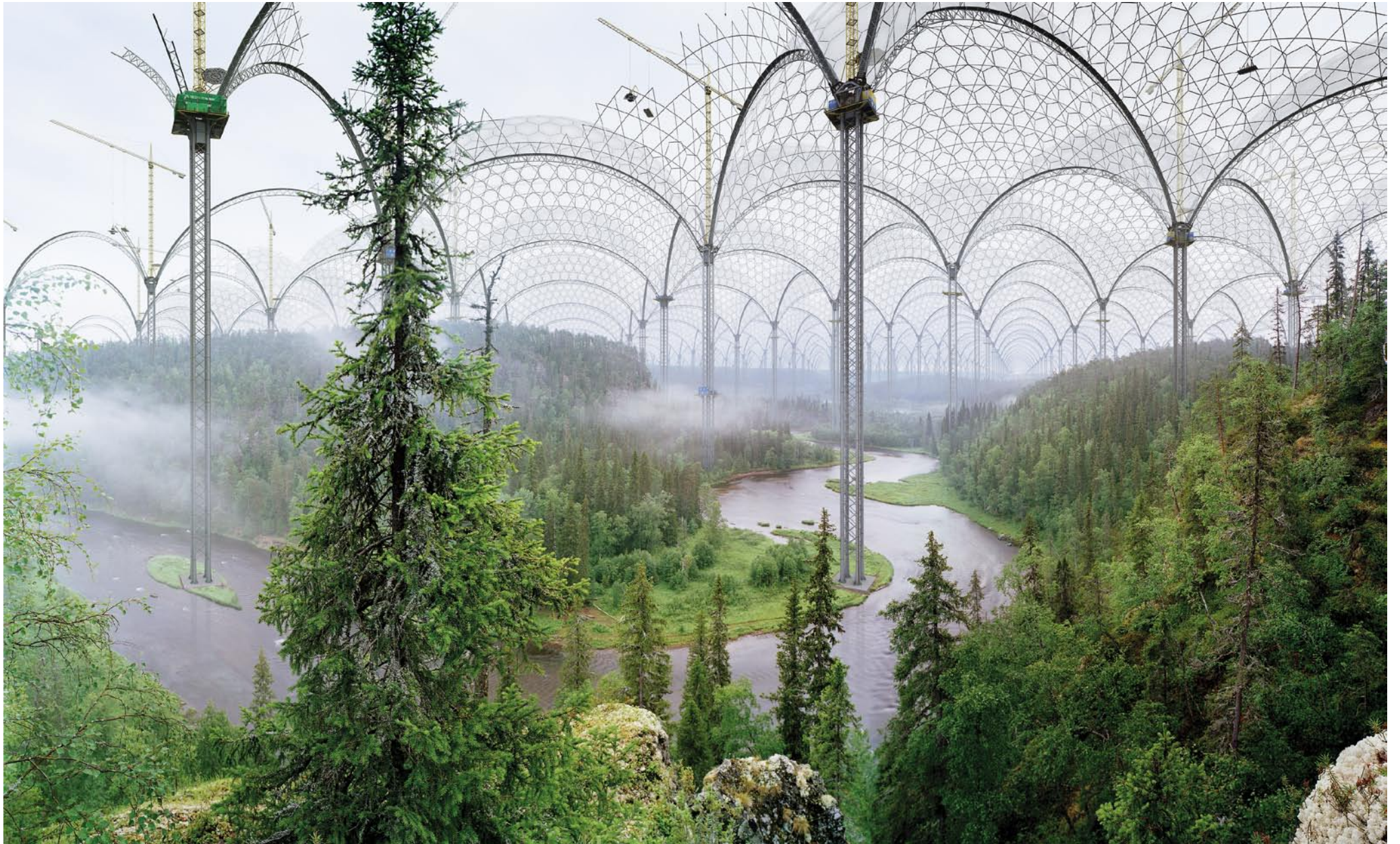
Kitka-river, 2004 (triptych)